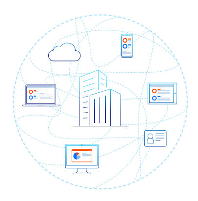
Al and Machine Learning to Identify Threats and Enable Workforce