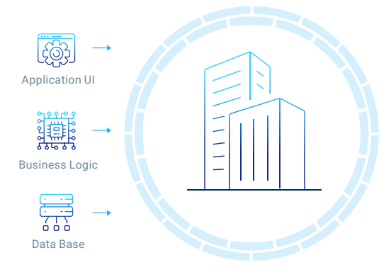
Monolithic and Manual Architecture